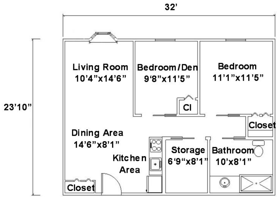
Parkview 2 Bedroom 761 Sq. Ft.