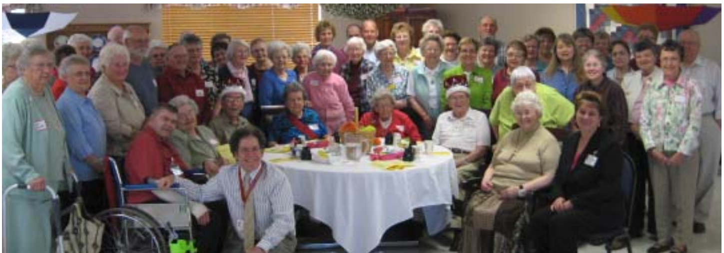
Volunteers Shower Us With Love

were handed out and conversation and laughter filled the room. The volunteers were greeted by the 2009 Kings and Queens of Hearts who began their public relation duties with this event.