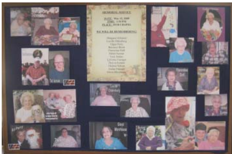
May's Memory Board

composed of pictures of those being remembered. It is put together at the end of the quarter and placed in our atrium a week prior to the service, is used at the service, and then moved back to the atrium for a week following the service. We hope to use these photos from throughout the year to create a collage at Christmas time to coordinate with our Love Lights project. We feel so blessed to have become acquainted with those entrusted to our care as well as with their families as we continue to carry out our mission statement of providing “A Christian Tradition of Caring.”